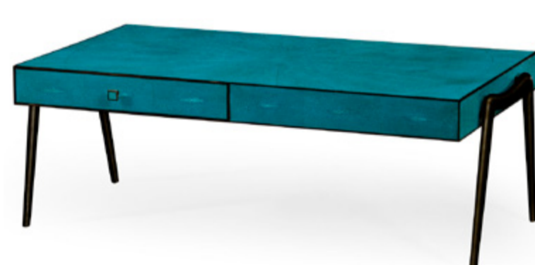
495202 & 495202-BRO